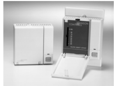
TE-6700 Series Temperature Elements